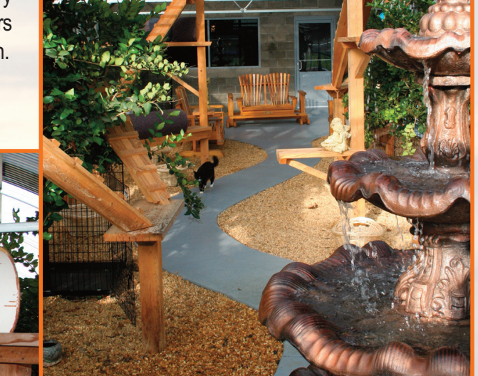
...we make absolutely sure that our animals are comfortable.